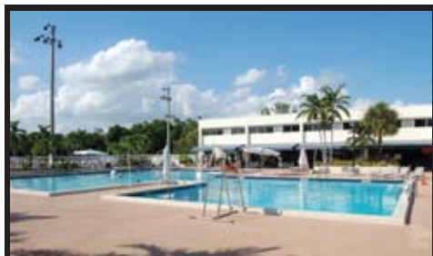
Outdoor Pool Complex - $250,000

The following naming opportunities are still available: