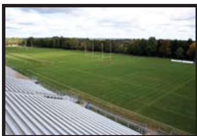
Bleachers and Covering for Athletic Field - $150,000