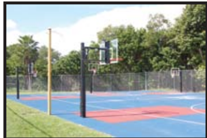
Outdoor Basketball Complex - $150,000